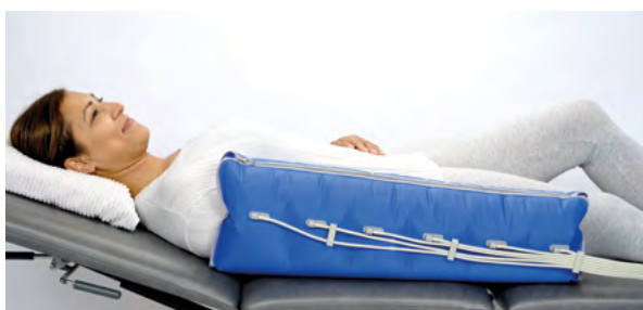
arm sleeve with 6 air chambers full-length zip upper arm circumference up to 60 cm, length 67 cm