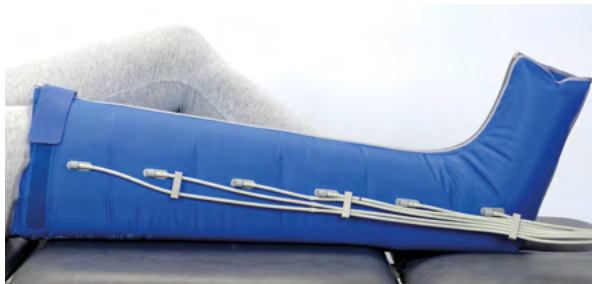
leg sleeve with 6 air chambers full-length zip, Velcro fastening Size M: thigh circumference 70 cm, length 85 cm Size L: thigh circumference 83 cm, length 85 cm

The full-length zip facilitates fitting and cleaning. An additional Velcro fastening allows an optimal adjustment to the thigh.