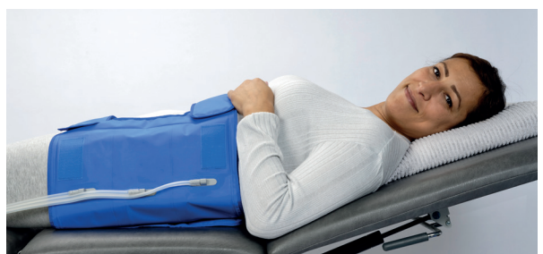
hip sleeve with 6 air chambers variable Velcro fastening on front and rear hip circumference adjustable up to 150 cm, length 38 cm

Home therapy is expedient in the case of increasing need of therapy, chronic syndromes, drug intolerance (e.g. diuretics), or intolerance of permanent compression.