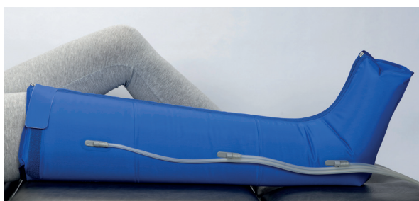
leg sleeve with 3 air chambers full-length zip, Velcro fastening Size M: thigh circumference 70 cm, length 85 cm Size L: thigh circumference 83 cm, length 85 cm