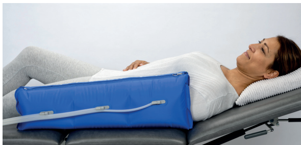
arm sleeve with 3 air chambers full-length zip upper arm circumference up to 60 cm, length 67 cm

Arm and leg sleeves have a full-length zip which facilitates fitting and cleaning. The additional Velcro fastening allows an optimal adjustment to the thigh. The hip sleeve can be changed in size individually.